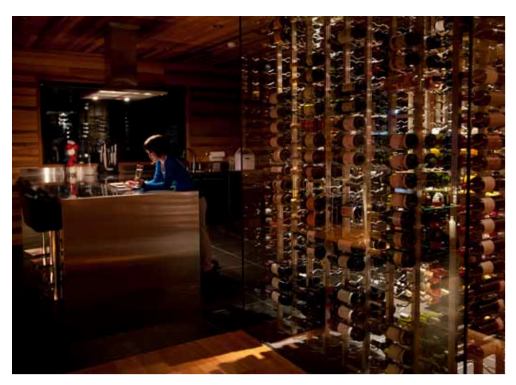
The expansive wine room, including multiple bottles of Dom Perignon, is climate controlled by the programmed shades, which open and close accordingly-and automatically-all year long.

But don't think for a nanosecond that the system could ever control the owners: "We travel a lot and