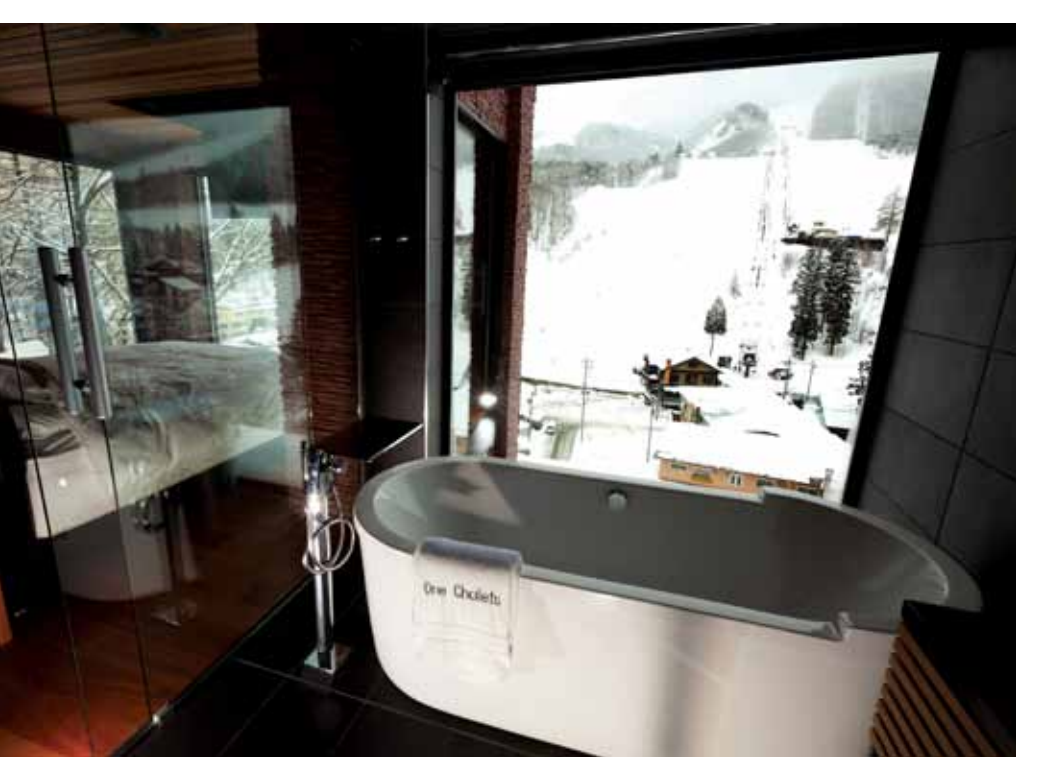
In each en suite bathroom, you'll find an iPad or touch screen next to the tub. Queue up your favorite music and stream it through the ceiling speakers as you soak your cares away.

I'm not ashamed to admit that we set out with utter perfection in mind for all aspects of building One Happo, but the home automation aspect is the piece that has guests consistently enthralled.